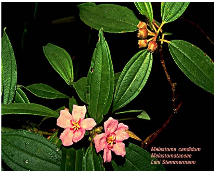
Melastoma candidum Melastomataceae