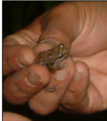
Captured Coqui Frog

Thanks go out to the Kauai Coqui Frog Working Group members who collaborate and assist with this project: Hawaii Department of Agriculture, College of Tropical Agriculture and Human Resources, DLNR-Division of Forestry and Wildlife, County of Kauai, Garden Island RC&D, Kukui'ula Development, A&B Properties, and Lawai Highland neighbors.