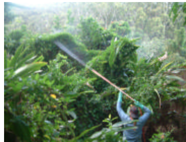
KISC Crew spraying at Lawai site

Thanks go out to the Kauai Coqui Frog Working Group members who collaborate and assist with this project: Hawaii Department of Agriculture, College of Tropical Agriculture and Human Resources, DLNR-Division of Forestry and Wildlife, County of Kauai, Garden Island RC&D, Kukui'ula Development, A&B Properties, and Lawai Highland neighbors.