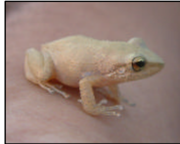
Male coqui frog, pale coloring

Thanks go out to the Kauai Coqui Frog Working Group members who collaborate and assist with this project: Hawaii Department of Agriculture, College of Tropical Agriculture and Human Resources, DLNR-Division of Forestry and Wildlife, County of Kauai, Garden Island RC&D, Kukui'ula Development, A&B Properties, and Lawai Highland neighbors.