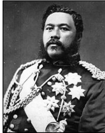
Prince Jonah Kuhio Kalaniana'ole

Thanks go out to the Kauai Coqui Frog Working Group members who collaborate and assist with this project: Hawaii Department of Agriculture, College of Tropical Agriculture and Human Resources, DLNR-Division of Forestry and Wildlife, County of Kauai, Garden Island RC&D, Kukui'ula Development, A&B Properties, and Lawai Highland neighbors.