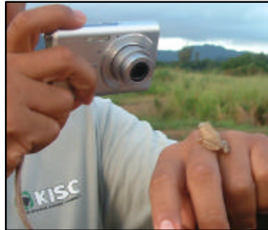
Tiny amphibian model

Citric acid is scheduled to be applied as a ground-drench in section 16, weather permitting, as well as any areas where calling frogs are heard.