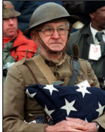
Honor our veterans! Veterans Day, November 11, 2008