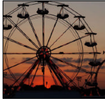
Come join us at the County Fair!

Please join us at our booth during the Farm Bureau Fair from Thursday, August 28 to Sunday, August 31. There will