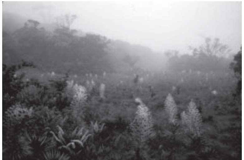
Greenswords growing in a montane bog

If protected from repeated pig disturbance, Oreobolus is able to recover by reseeding itself. This happened in Greensword Bog in about three years. Less common plants recover much more slowly, and researchers speculate that some rare species may not recover at all. Over time and with continued protection from pigs, researchers are hopeful that Greensword Bog will one day look much as it did in 1973.