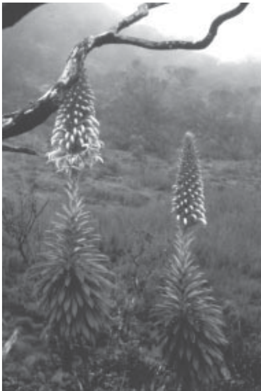
Lobelia gloria-montis grows at the drier margins of bogs, in the rain forest, and on ridge lines. It forms flowering spikes as tall as 4 meters (13 feet).

When pigs feed in the rain forest, there is no mistaking that they have been there. Large areas may look like a rototiller has gone through,