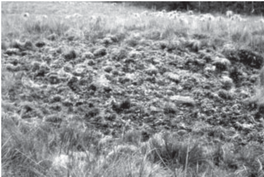
Pig damage in a bog

Greensword Bog was named for the Maui greensword—a relative of the ‘āhinahina (Haleakalā silversword)—that grew in and around the bog. But in June 1981, there were no greenswords to be seen in the bog. In fact, there was very little vegetation of any sort left in the central part of the bog.