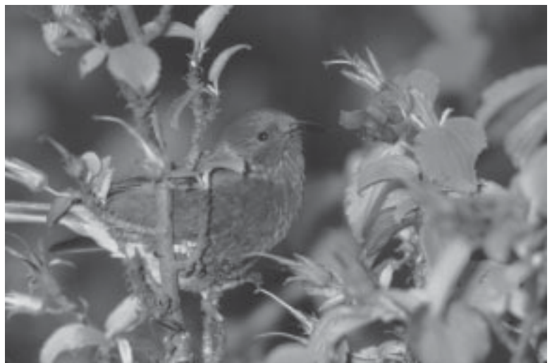
‘Apapane This native bird commonly ventures into the bogs from the surrounding rain forest habitat.

Researchers say that the bogs of Haleakalā are rich with opportunities for studying how species adapt to extreme environments. Looking for insights into evolutionary processes, researchers will continue to study these bogs.