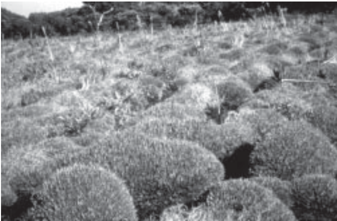
An Oreobolus bog in its natural state

Bog plants are adapted to a unique set of environmental conditions. The montane bogs in the Hāna rain forest are located in an extremely wet area. Clouds cover the bogs almost continually, precipitation is high, and drainage is poor. Here are some other features of the bog environment: