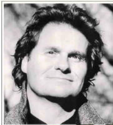
WADE DAVIS EXPLORER IN RESIDENCE WITH THE NATIONAL GEOGRAPHIC SOCIETY